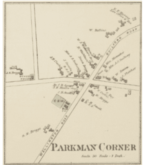
Parkman Corner circa 1882